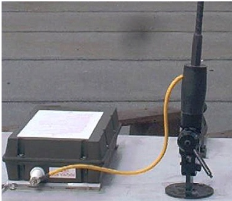
Automatic Antenna Tuner

Step 4 Route the high voltage antenna lead-in cable the antenna tuner to hex nut (2). One end of the cable should be connected to the tuner (see tuner manufacturer's instructions).